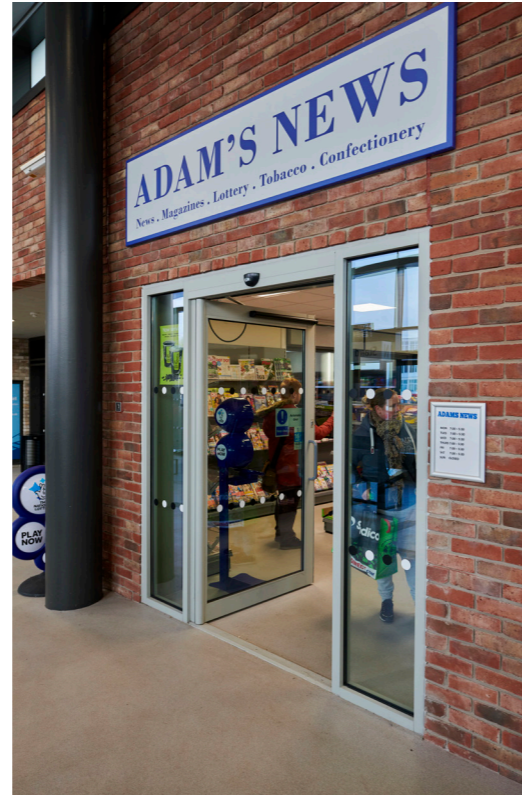
Automatic swing door