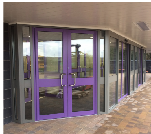
Manual swing door